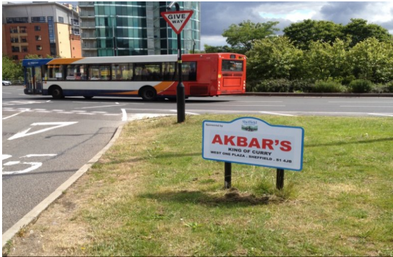
Example Roundabout Sign in situ