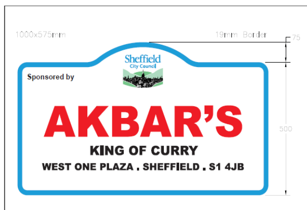
Example Roundabout Sign

There are 224 Roundabout and Boundary/Gateway signs in various locations throughout the City. These signs are located on roundabouts and attached to the City Boundary signs. The design of the signs is intended to provide company information that can be easily seen by highway users, incorporating the company's name, telephone number or website address.