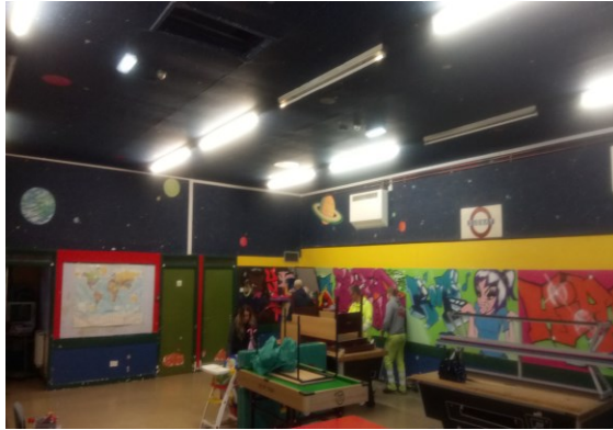
Heeley Farm community hall, before photo