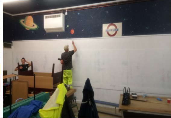
Heeley Farm community hall, during the charity work by Amey employees