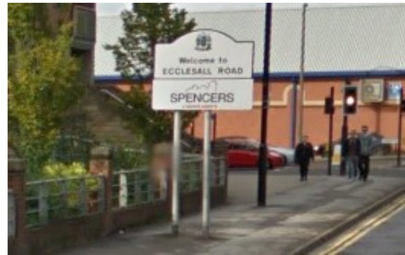
Example Boundary Sign in situ