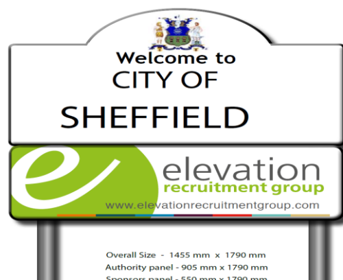
Example Boundary Sign