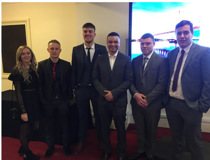
Picture of the six apprentices collecting their awards in December