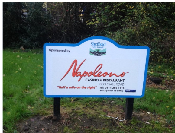
Example Roundabout Sign in situ

Activity on sponsorship can also be followed via our Twitter and LinkedIn accounts: