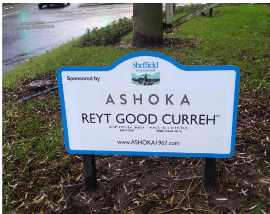
Example Roundabout Sign in situ